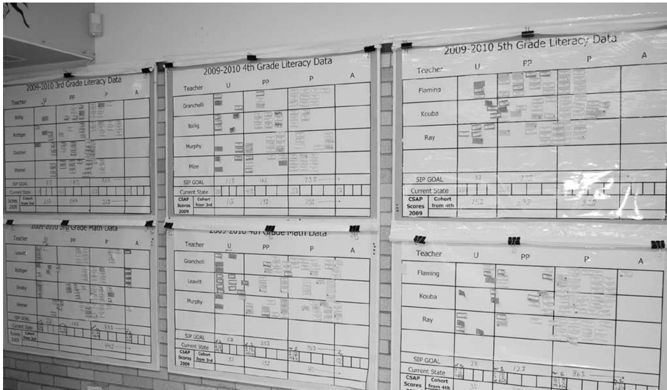
An example of a data wall at Aurora Public Schools.

“Large scale improvements in student achievement occur when there is large scale improvement of day-to-day classroom instruction. Our data teams now provide the formal structure for teachers to work collaboratively to make instruction more effective.”